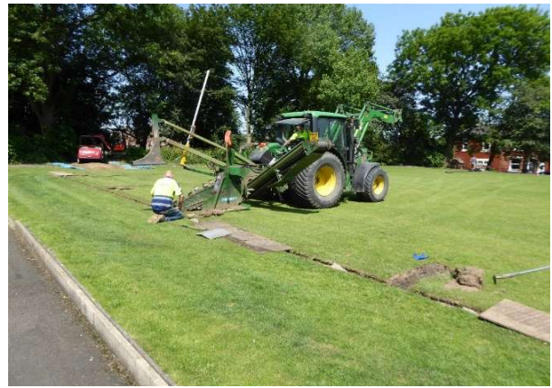
work in progress