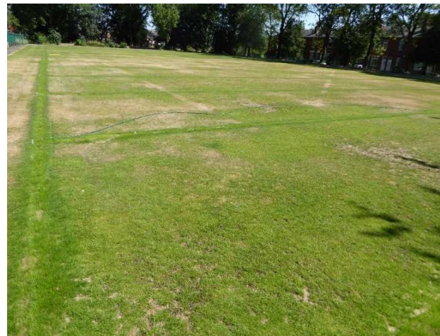
lawn on 4th July